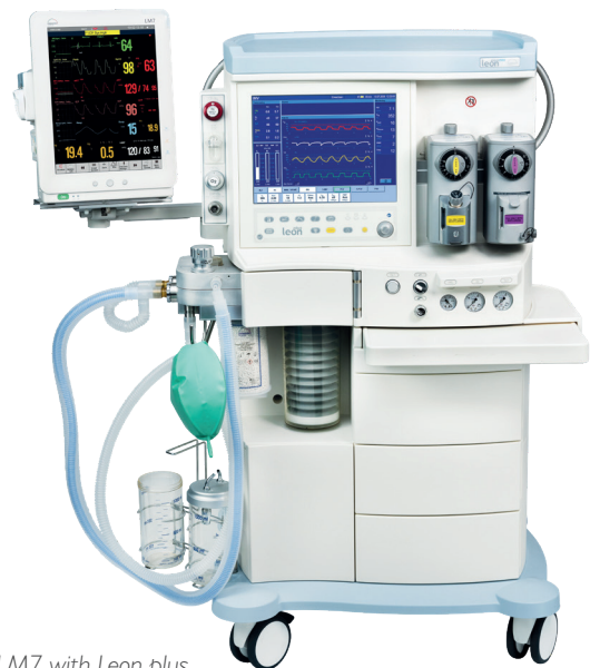
LM7 with Leon plus